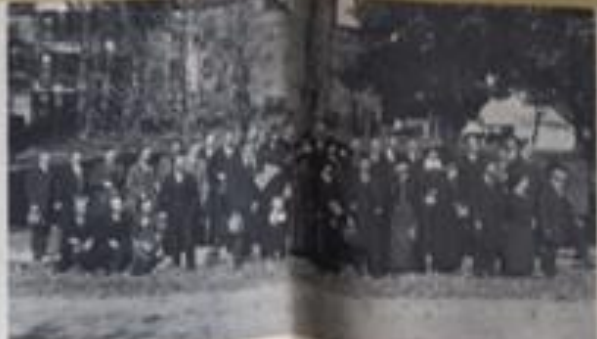
Rotary Club members — (left) ... (right) ...

The club's activities are diverse and include many projects that benefit the community. These projects range from the most basic to the most advanced, and they are all carried out with the highest standards of service. The club's members are proud of their record of service, and they are committed to continuing this tradition in the future. They believe that the Rotary Club is an essential part of any community, and they are determined to make a difference in the lives of the people of Tullahoma.