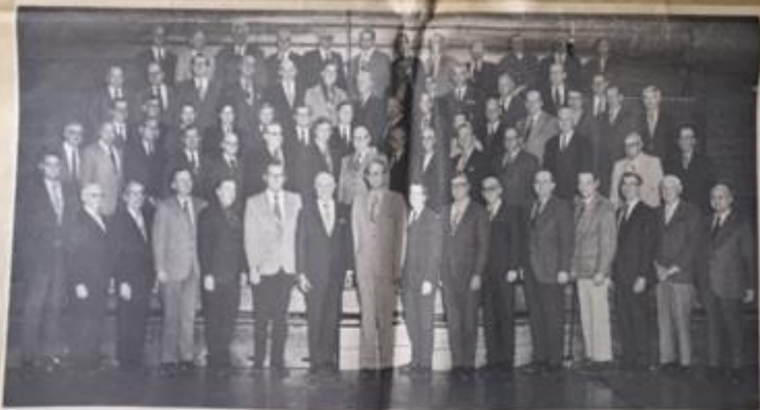
Tullahoma Rotary Club Membership--March 3, 1972